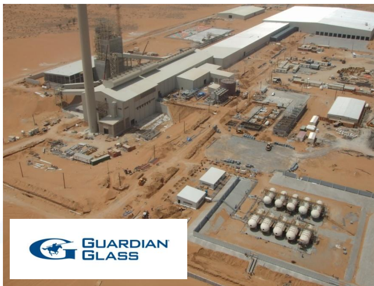
Guardian Glass Factory in Ras Al Khaimah

Guardian Glass has invested significantly in advanced coating technology to produce energy-efficient glass, as well as in high-performing environmental control technologies for its manufacturing operations. Its glass has been used on the world's tallest building, the Burj Khalifa, among other important buildings in the U.A.E.