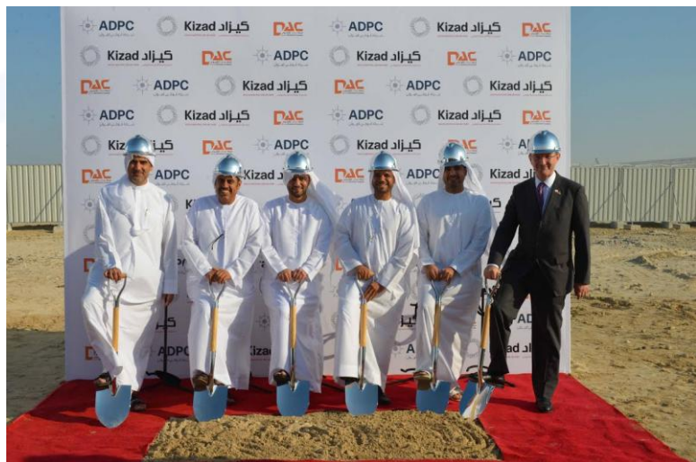
Ducab Aluminium, a Senaat-Ducab JV, breaks ground on facility in Khalifa Industrial Zone Abu Dhabi

Looking ahead, the prospects for U.A.E. manufacturing are bright. U.A.E.-based industry is poised to capitalize on the country's strategic location as well as its world-class transportation and industrial infrastructure. It is also set to benefit from relatively low taxes, business-friendly regulations, and the ready availability of energy, goods, and labor. These advantages should help U.A.E.-based manufacturers navigate any challenges from lower oil prices, increasing regional competition, persistent foreign dumping, or a rising global wave of protectionism.