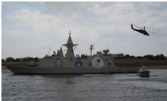
Baynunah Class Corvette at Navdex

Abu Dhabi Ship Building (ADSB) has distinguished itself as a leading shipbuilder and support contractor for naval, military, and commercial operators in the region. Established in 1996 to support the repairs and refits of U.A.E. navy vessels, it currently has a portfolio of construction and refit projects worth over $820 million (3 billion AED), according to its website. As part of these projects, it is leading the region’s largest-ever naval shipbuilding program to build six Baynunah class corvettes for the U.A.E. navy. 94