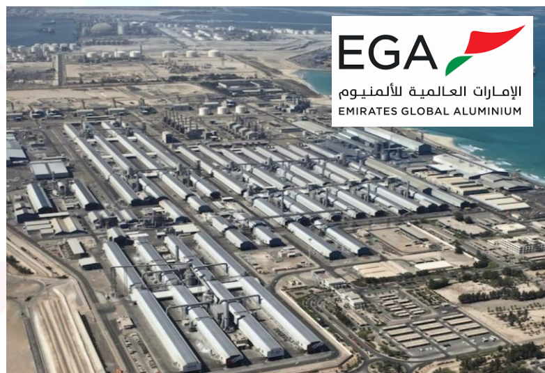
Aerial View of Emirates Global Aluminium Smelter in Dubai

The U.A.E. is a major player in the global aluminum industry, thanks to Emirates Global Aluminium (EGA). Owned equally by Mubadala Investment Company and the Investment Corporation of Dubai, EGA's two smelters make the U.A.E. the fifth-largest aluminum-producing country in the world. EGA is also one of the world's largest 'premium aluminum' producers, making value-added products to customers' specifications. In addition, it owns Guinea Alumina Corporation (a company developing a bauxite mining project in Guinea) and the under-development Al Taweela Alumina Refinery in Abu Dhabi. 19