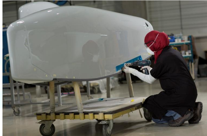
Strata Engineer Working on Aircraft Component

A star of the U.A.E.’s aerospace sector is composite aero-structures manufacturer Strata. Strata, which was created in 2009 as a wholly owned subsidiary of Mubadala, manufactures a wide variety of components for Airbus, Boeing, and ATR aircraft. 82 In 2016, Strata shipped a total of 521 shipsets, consisting of over 9,103 parts, to its customers. This number is likely to expand with the growth of Strata’s floor space from 31,500 square meters in 2016 to over 60,000 square meters in 2017 and 120,000 meters by 2020. 83 At the same time that it has expanded its own capacity, Strata has invested in building an aerospace supply chain in Abu Dhabi, with over half of its suppliers being locally-based. 84