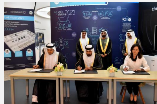
His Highness Sheikh Mohammed bin Rashid witnessing the signing of an MoU between GE, Mubadala, and Dubai Future Foundation