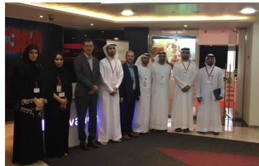
Emiratis visit 3M Customer Innovation Center in the U.A.E.

U.S. companies have also helped address this talent gap through training programs and centers. For instance, Lockheed Martin, the U.A.E. Space Agency, and Mubadala launched a workforce training program to develop emerging leaders in the U.A.E. space industry. 146 Moreover, leading U.S. manufacturer 3M has invested in building and operating two Customer Innovation Centers in the U.A.E. to serve as centers of knowledge transfer to U.A.E. nationals and residents.