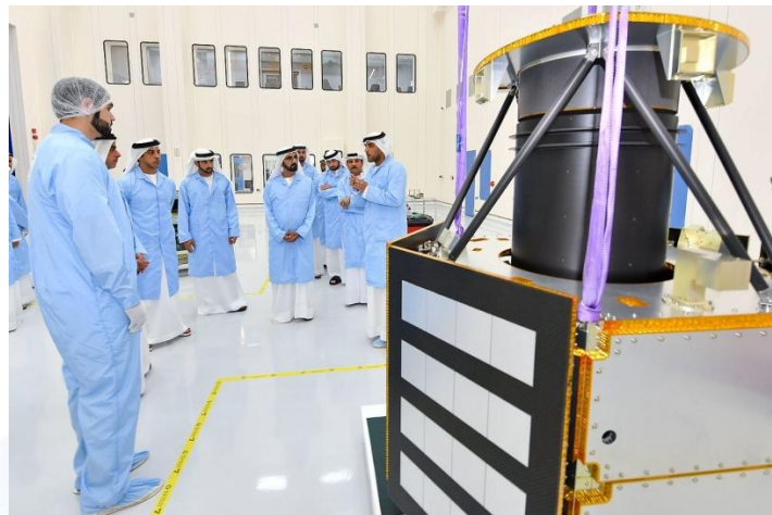
HH Sheikh Mohammed bin Rashid Al Maktoum is briefed on the progress of KhalifaSat (Nov. 2016)

The U.A.E.'s budding space program is a point of national pride and the U.A.E. has correspondingly begun developing an indigenous capacity to build satellites. In 2014, the U.A.E. announced that the country's first factory for making satellites would soon be completed at the Emirates Institution for Advanced Science and Technology (EIAST) in Dubai and that Emiratis would use this factory to complete the last phase of constructing the first Arab satellite, KhalifaSat. 99 In 2015, EIAST was rebranded as the Mohammed bin Rashid Space Center and its remit expanded to include leading the U.A.E.'s Mission to Mars. 100 The Mohammed bin Rashid Space Center's activities have been complemented by those of Yahsat, a Mubadala Company, which has collaborated with EADS, Thales, and Alenia Space to develop a fully integrated satellite system, launching its first satellite as early as 2011. 101