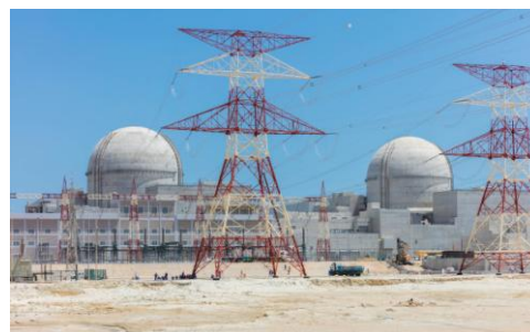
Barakah Nuclear Power Plant

In 2013, the KEPCO-led consortium broke ground on the first reactor at this plant. Since then, construction has proceeded steadily such that, as of the end of September 2017, the overall completion rate for the plant was 84.92%, with Unit 1 96.83% complete, Unit 2 89.21% complete, Unit 3 78.84% complete, and Unit 4 59.47% complete. To date, this has entailed more than 1.4 million cubic yards of concrete, 250,000 tons of reinforcing steel, and 1,559 kilometers of cable. 19