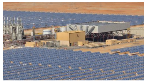
Shams 1 Solar Plant

The U.A.E.'s pursuit of solar energy began with Masdar. In 2009, Masdar completed a 10 MW solar photovoltaic (PV) power plant to provide electricity to Masdar City, with 50% of the panels coming from a U.S. company, First Solar. Masdar subsequently partnered with Total and Abengoa Solar to construct a 100 MW concentrated solar power (CSP) plant called Shams 1 in the Western region of Abu Dhabi. After its completion in 2013, this plant became the largest renewable energy project in the Middle East, generating enough electricity to power 20,000 homes. 30