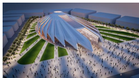
Expo 2020 U.A.E. National Pavilion

On top of these annual events, the U.A.E. will soon be host to Expo 2020 Dubai, or the World's Fair. Expo 2020's theme is "Connecting Minds, Creating the Future," and one of its subthemes is "Sustainability." 92 In keeping with this theme, Expo 2020 Dubai has partnered with DEWA as its Official Sustainable Energy Partner and committed to ensuring that half the energy used by the Expo will come from renewable sources, with 400 MW of electricity coming specifically from the Mohammed bin Rashid Al Maktoum Solar Park. 93 Expo 2020 Dubai will also have a Sustainability Pavilion that will produce 4 GWh of electricity per year through solar panels – more than the building needs to operate, allowing it to feed excess power into the electric grid. 94 Meanwhile, Masdar was appointed program manager for the U.A.E. Pavilion at Expo 2020 on the basis of its track record of successfully delivering highly innovative and sustainable projects. The winning design, which is in the shape of a Falcon, will embrace sustainable building principles. 95