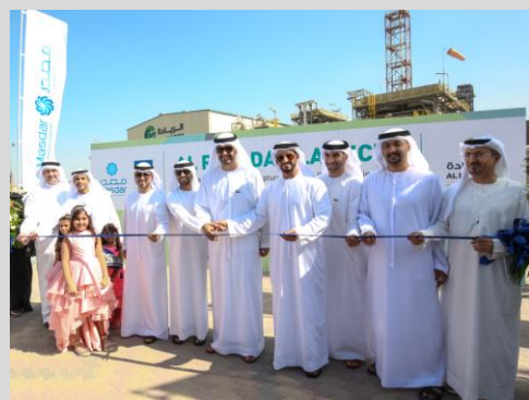
Inauguration of Al Reyadah Facility