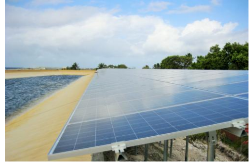
Masdar Project in the Marshall Islands

The ADFD has been active in supporting solar energy projects beyond these two funds. In fact, ADFD has vowed to provide concessional loans worth a total of $350 million over seven annual funding cycles to promising renewable energy projects in developing countries identified as such by IRENA. Since 2012, ADFD has already allocated $214 million in loans to 21 solar projects, including projects in Antigua & Barbuda, Burkina Faso, Cape Verde, Cuba, Mali, Mauritius, Niger, Rwanda, Senegal, the Seychelles, and Sierra Leone. 65