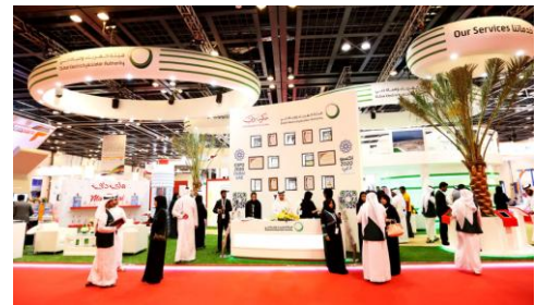
DEWA Exhibition at WETEX

Every October, the U.A.E. is also host to the Water, Energy, Technology and Environment Exhibition (WETEX). This exhibition – under the patronage of His Highness Sheikh Hamdan bin Rashid Al Maktoum, Deputy Ruler of Dubai, Finance Minister of the U.A.E., and President of DEWA – spans nine large halls at the Dubai International Convention and Exhibition Center that showcase the latest products, solutions, and technologies from almost 2,000 exhibitors. 90