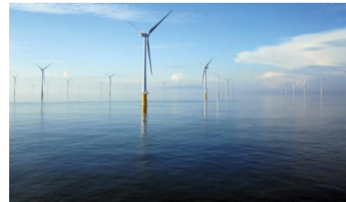
The London Array