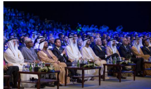
U.A.E. Vice President and Prime Minister and Ruler of Dubai HH Sheikh Mohammed bin Rashid Al Maktoum, Abu Dhabi Crown Prince and Deputy Supreme Commander of the U.A.E. Armed Forces HH Sheikh Mohamed bin Zayed Al Nahyan, and other dignitaries attend Abu Dhabi Sustainability Week

The U.A.E. has emerged as a regional hub for clean and alternative energy events such as Abu Dhabi Sustainability Week (ADSW). Every January, Masdar hosts this global forum, which brings public and private sector stakeholders together to address challenges and celebrate achievements in sustainable development and clean energy. Beginning with the IRENA General Assembly, ADSW includes a large number of events, ranging from the Zayed Future Energy Prize Awards Ceremony to the World Future Energy Summit, the International Water Summit, the EcoWaste Exhibition, and the Solar Expo. In 2017, ADSW had 38,000 visitors and 639 exhibiting companies from 30 countries. 89