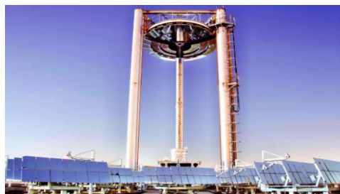
Masdar Solar Hub