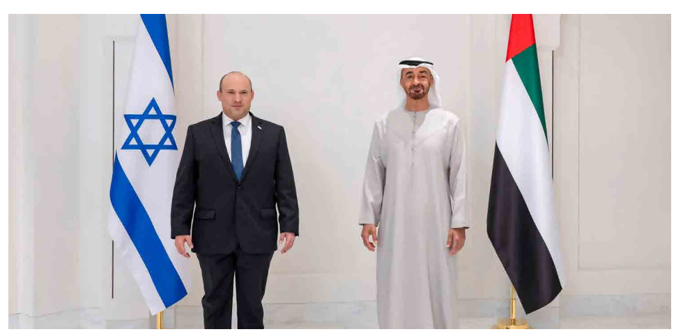
Abu Dhabi Crown Prince Sheikh Mohammad bin Zayed Al Nahyan with Israeli Prime Minister Naftali Bennett during a visit to Abu Dhabi in 2022

If all of this were not enough, the U.A.E. also welcomed Israeli Prime Minister Naftali Bennet to the U.A.E. in the same month Sheikh Tahnoun visited Tehran. The visit marked the most dramatic manifestation of the Abraham Accords signed in late 2020 that normalized ties between Israel and the U.A.E. Israeli President Isaac Herzog became the first Israeli President to visit the U.A.E. in January of 2022.