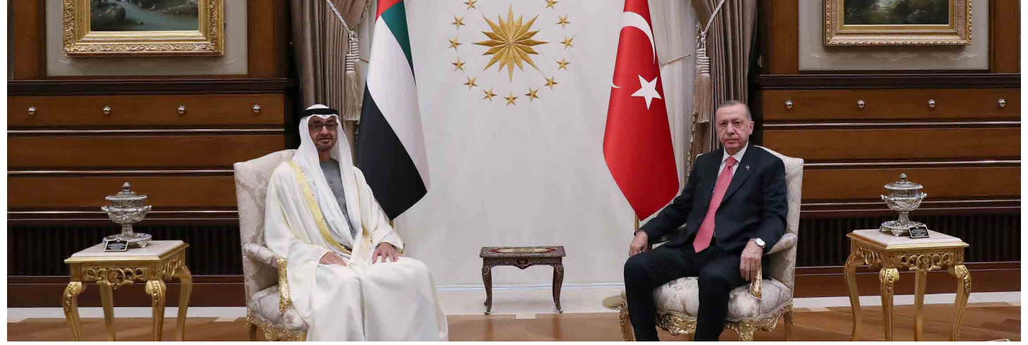
Abu Dhabi Crown Prince Sheikh Mohammed bin Zayed Al Nahyan with Turkish President Recep Tayyip Erdoğan during an official visit to Ankara in November 2021

A flurry of U.A.E. diplomacy toward the end of 2021, including high-level visits to Tehran and Ankara, signaled a consequential shift in U.A.E. foreign policy over the next five to ten years and possibly beyond. This shift includes an attempt to normalize relations with countries often seen as adversaries, a retreat from robust regional intervention, and an emphasis on a foreign policy that serves the U.A.E.'s economic interests above all else. This well-signaled new foreign policy outlook will have substantive ramifications for U.S. and U.A.E. businesses, and thus merits closer scrutiny.