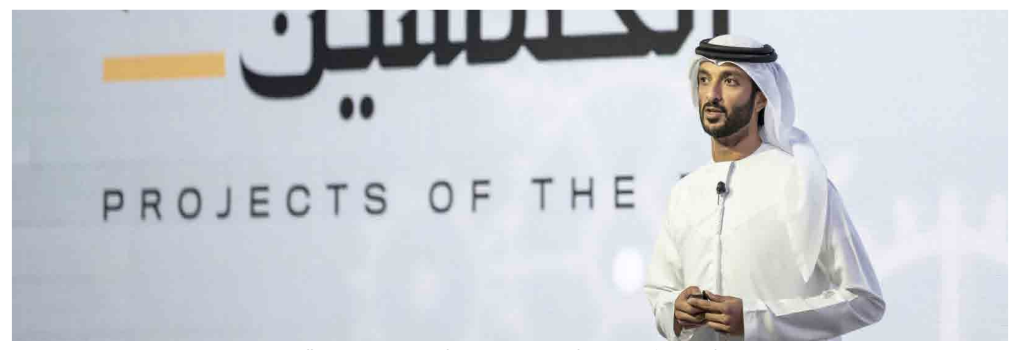
U.A.E. official announcing some of the initiatives as part of the country's 'Projects of the 50'

The United Arab Emirates has been a highly predictable environment for business over the last two decades. It has been marked by steady growth and steady efforts to build the infrastructure of connectivity, streamline bureaucracy, and empower businesses. The rules of the playing field are well-known. It ranks low in global corruption indexes and high in businessenabling environment indexes, and has mostly kept regional troubles outside of its borders.