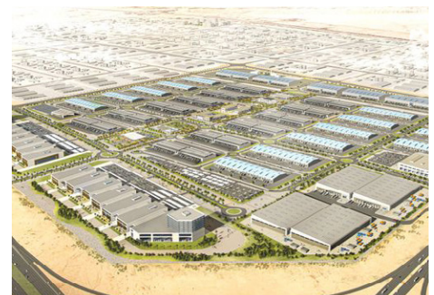
Abu Dhabi Food Hub