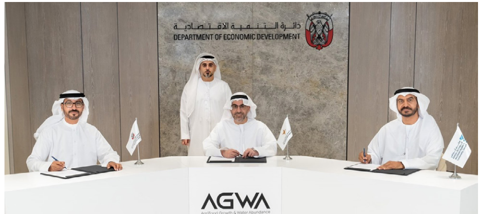
AGWA partners with key government stakeholders to build robust regulatory framework

The formation of AGWA, just the second in a series of Abu Dhabi ecosystem clusters, signals the importance the U.A.E. places on driving private capital to food security innovation. The AGWA food cluster will build on the successes of projects like the Abu Dhabi Food Hub and present investment opportunities for U.S. companies seeking a foothold in this emerging sector. U.S. companies joining AGWA will access an integrated cluster that includes advanced infrastructure, funding access, skilled talent, and partnerships with government entities, R&D institutions, and academia. U.S.-