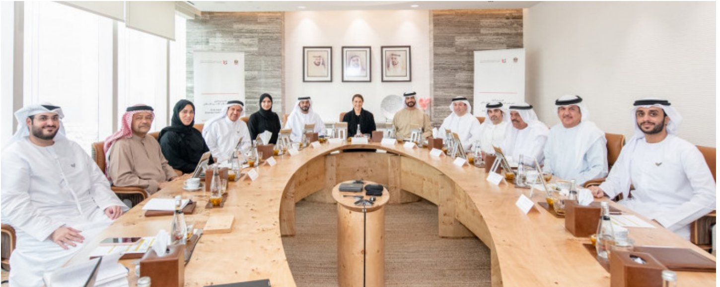
Emirates Food Security Council - WAM

In order to meet the benchmarks of the U.A.E. National Food Strategy, the U.A.E. is bolstering state institutions and programs designed to meet the food security challenge. The U.A.E. government first seeks to ensure food and water security for residents and create a strong enabling environment where both private and public institutions innovate in the area of food security.