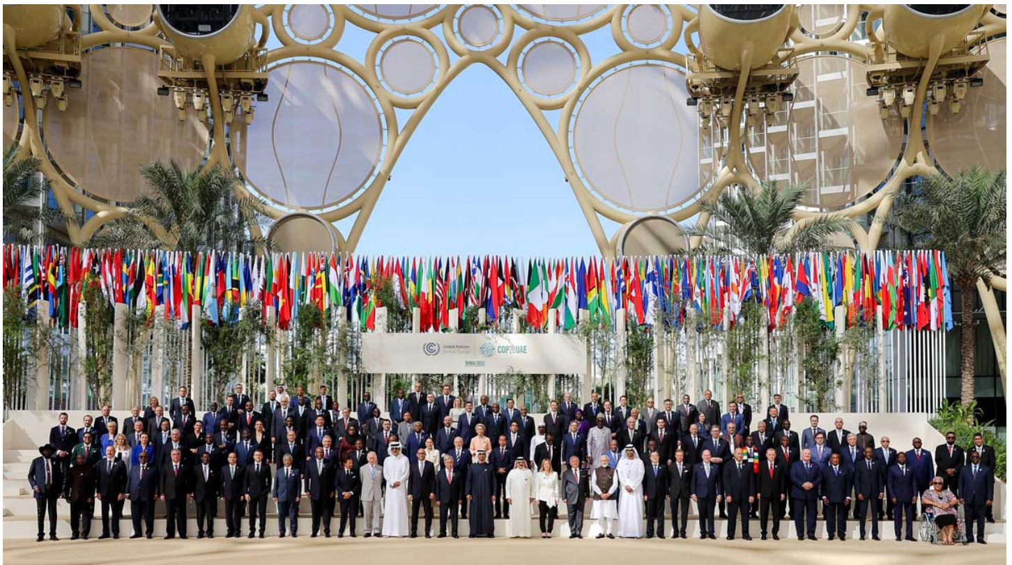
COP28 U.A.E.

Beyond ensuring the security of its food supply and logistics chains, the U.A.E. government is increasingly focused on developing a global network and a local technology ecosystem that secures their role as a global leader on food security. The U.A.E., as a diplomatic leader of the Global South, also seeks to drive food and water security in developing countries, particularly in Sub-Saharan Africa. The U.A.E.'s food security ambitions dovetail with the U.A.E.'s broader sustainable development agenda. The U.A.E. is emerging as an important player driving solutions to global food security challenges through international partnerships, including with the United States. These include major international agreements and partnerships forged around COP 28 hosted in Dubai during the U.A.E.'s presidency of COP.