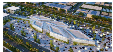
Innovation and R&D Centre - Food Tech Valley (Dubai)