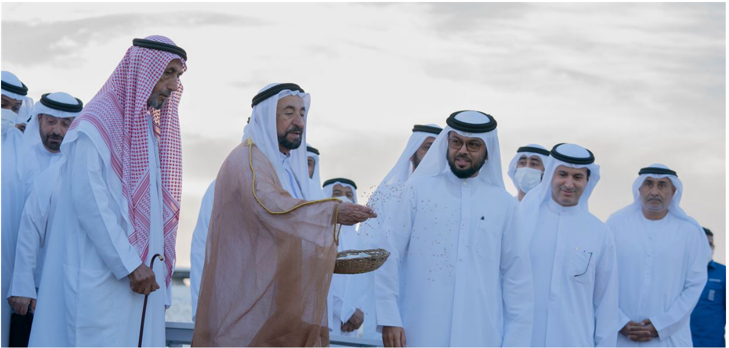
Sharjah Ruler inaugurates wheat farm 1st phase in Mleiha