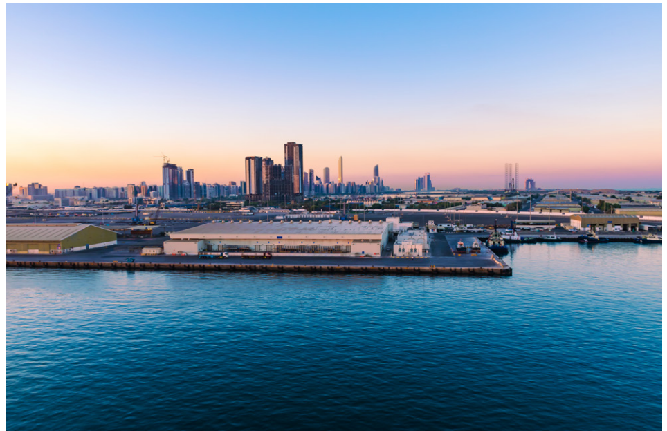
Abu Dhabi Port